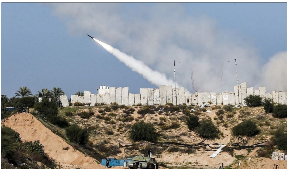
One of the rockets coming from Gaza to Israel

The alarms have been going off all week. Day and night. Yesterday, right after the church service, we had another attack. This time, a missile landed 1400 meters away from our home. This time we felt the explosion louder than other times. I had never seen the destructive power of a missile firsthand. Shrapnel everywhere. Busted glass even at 100 meters from the explosion. It's something that is very hard to digest. One person died in yesterday's attack. So far, 10 people have died in Is-